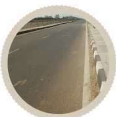
30 & 40 ft. Road