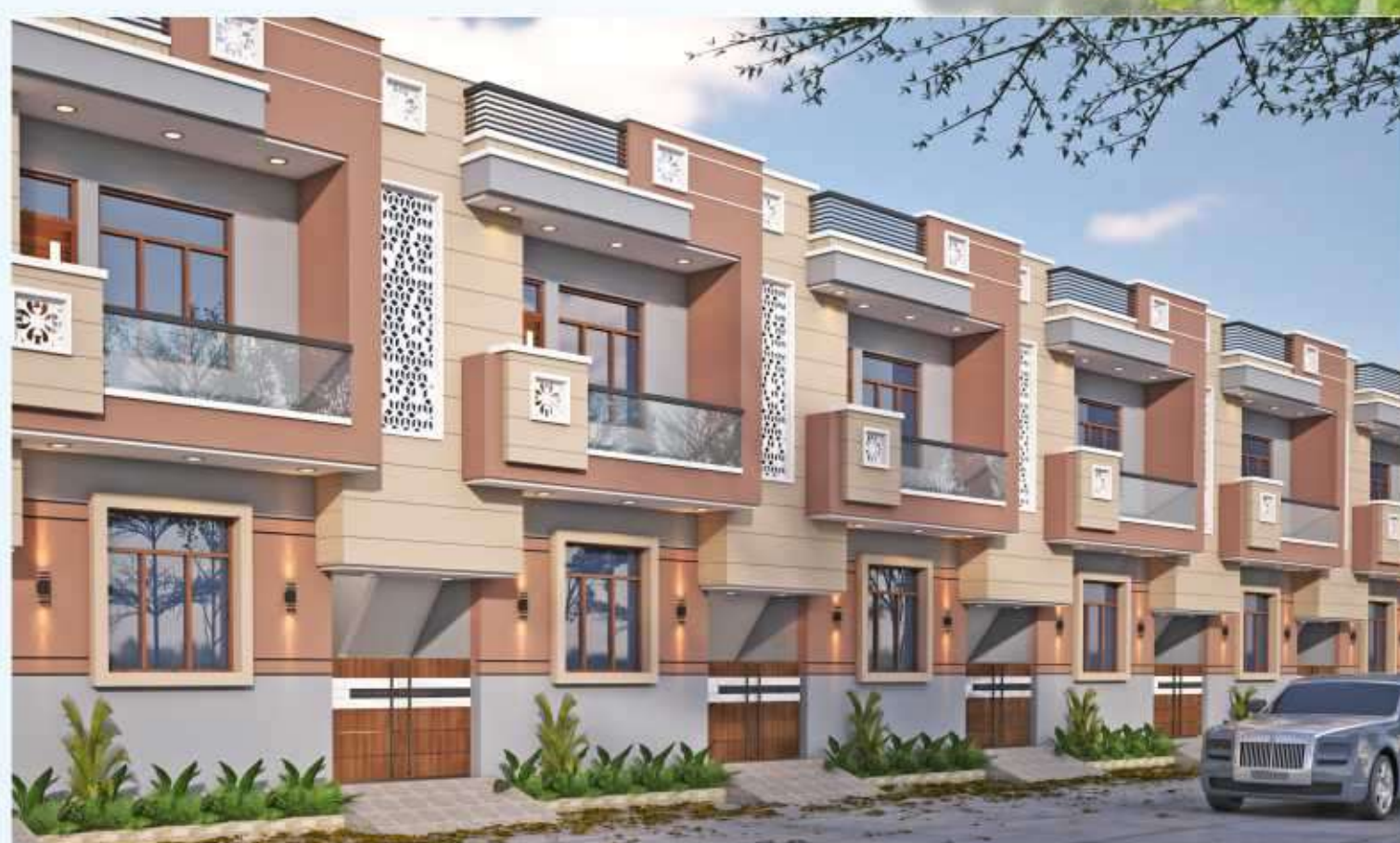
AGRSEN NAGAR IVTH