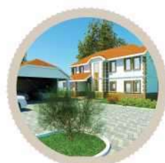
Approved Housing Scheme