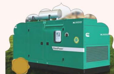
Power backup in common area