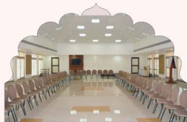
Multi purpose Hall