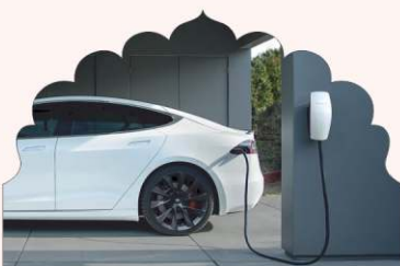
Vehicle Charging point