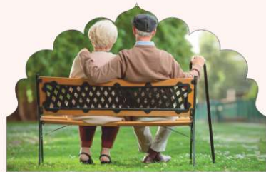
Senior citizen area