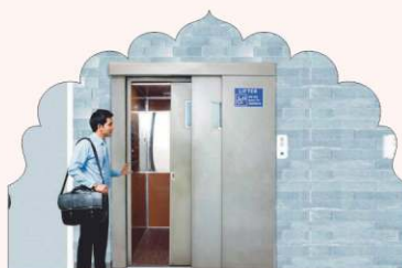
High speed elevators