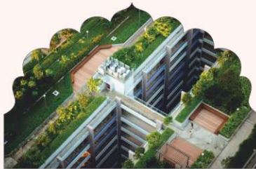
Sky walk on terrace