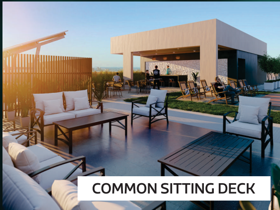
COMMON SITTING DECK